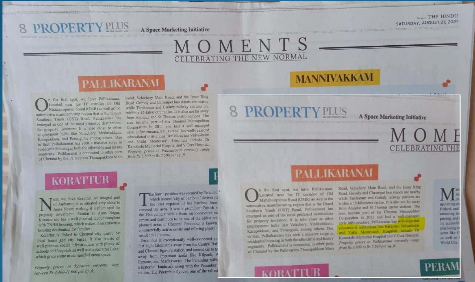
Pallikaranai has well-regarded educational institutions like Narayana Vidhyashram and Vrithi Montesory... The HINDU: Dated: 21st August 2021